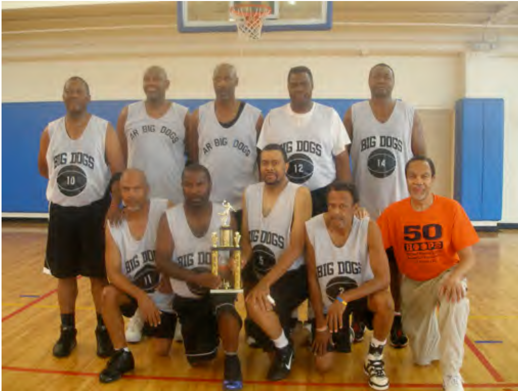
Men 50 – 60 Senior Olympic Champions 50 Hoops Partners for nearly a decade